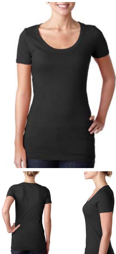
Featured Color: BLACK